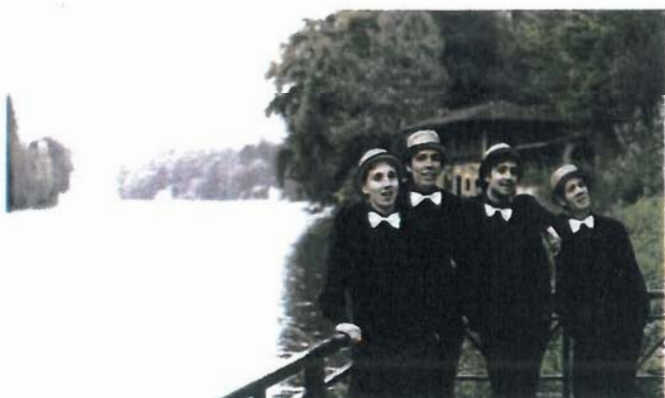
Rolling Cobs (Parco del Valentino, Torino)

When we sing together, an unstoppable wave of energy is created, the result of encounters, of a shared harmony and the opening of new horizons within oneself. A choir represents a social model where listening, respect, cooperation and solidarity work together with art, beauty and culture, where tradition and innovation blend not