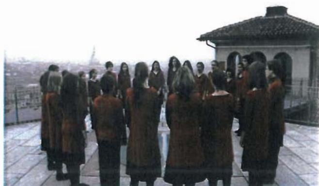
Piccoli Cantori di Torino (Museo Nazionale della Montagna Duca degli Abruzzi - CAI, Torino)